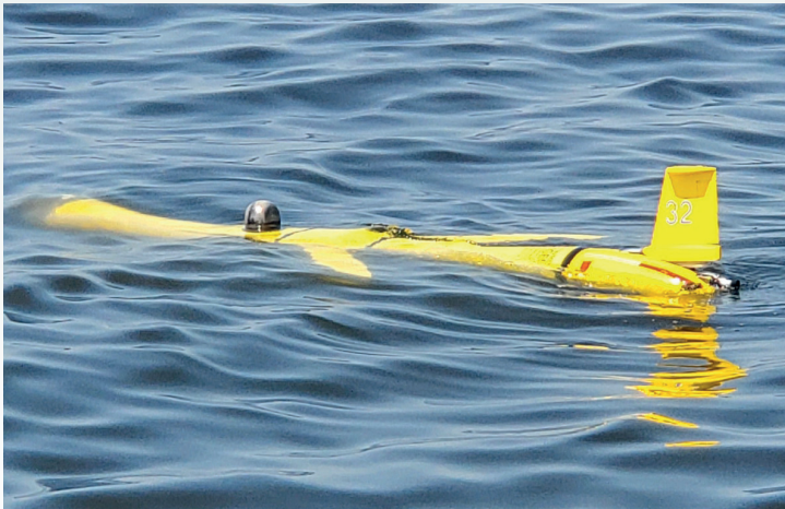
Glider with LISST-Glider module in operation.