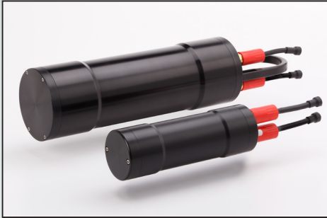
Large & Small External Battery Housings