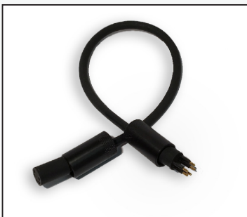
Short Battery Cable