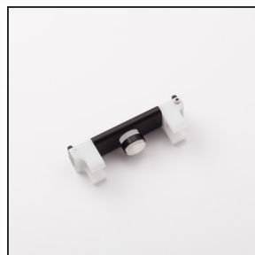
Optical Path Reduction Module