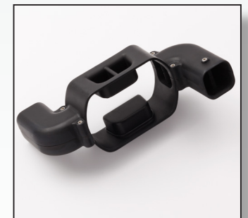
Scoop (for diverting flow of water through optical path)