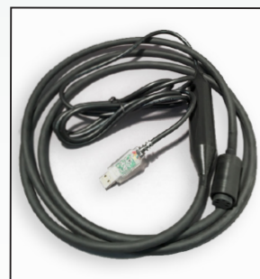
Integrated Comm & Power Cables