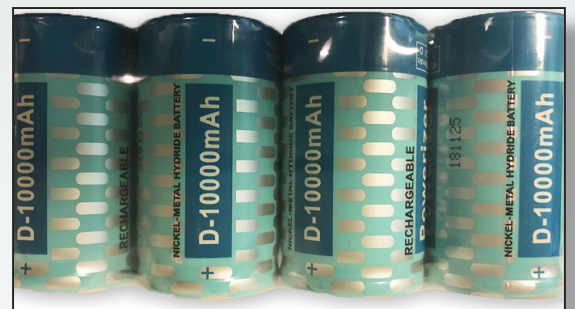
Replacement Rechargeable Batteries