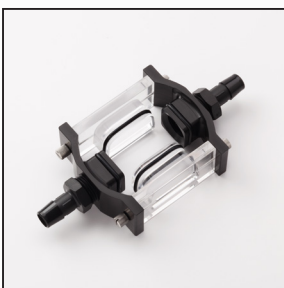
Full Path Flow Through Chamber