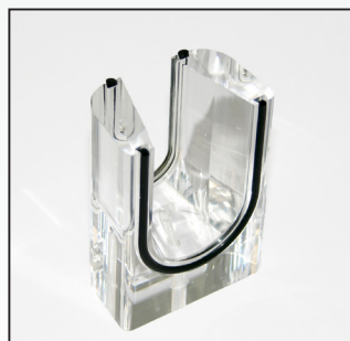
Background Test Chamber