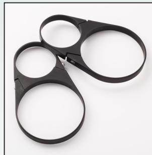
Small Battery Housing Clamps